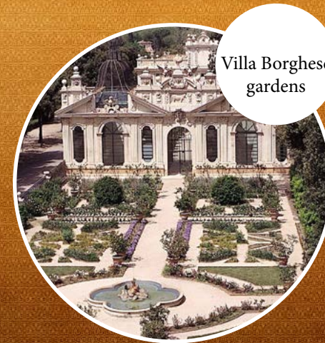
Villa Borghese gardens

Theme: "Diabetes Management address improvements in Current Therapeutics"