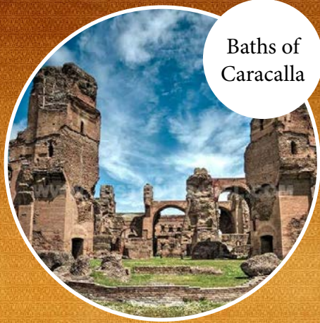
Baths of Caracalla